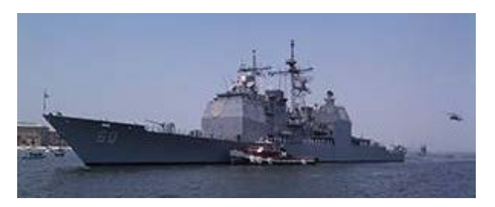
Guided Missile Cruisers,