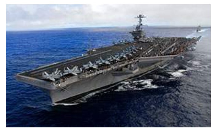
Aircraft Carriers and more.