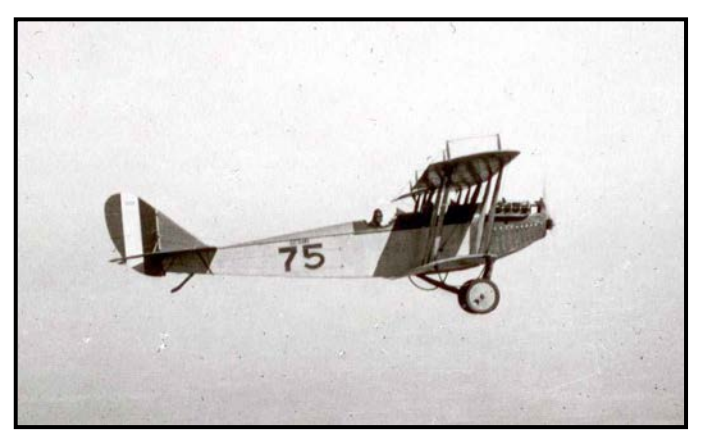
On Saturday, we will heading out to the Military Aviation Museum in Virginia Beach. We will be attending the 5th Annual "Biplanes and Triplanes" Air

Show. Among the stars of the weekend will be a rare airworthy example of a genuine 1918 Curtiss JN-4D Jenny.